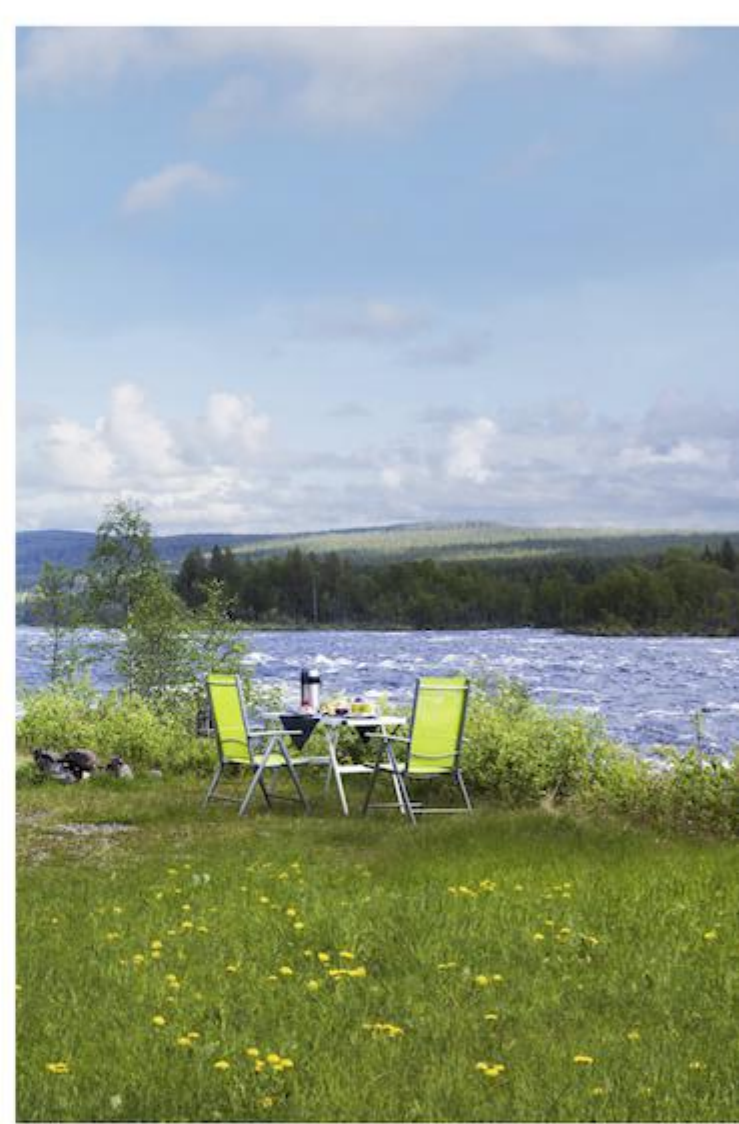
1 Campings Łódź