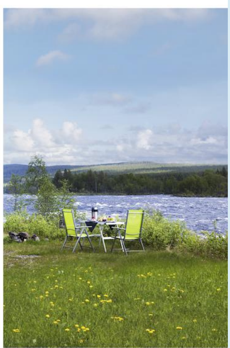
1 Campings Andros